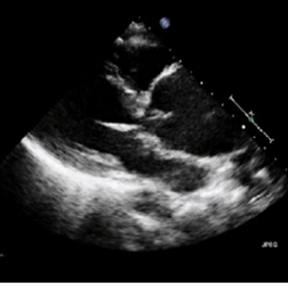
Figure 2 (A) long-axis view of aortic root measuring a maximum of 3.8 cm; (B) seven years later long-axis view of aortic root measuring a maximum of 6.2 cm which required urgent aortic surgery.

autosomal dominant disease with variable expressivity involving a number of systems mainly cardiovascular, ocular and skeletal. Prevalence is as much as 17 cases per 100,000 population and ~25–30% mutations are de novo.