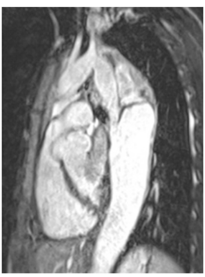
Figure 3 (A) MRA of aorta in patient with TGFBR1 mutation; (B) MRA demonstrating type B dissection and rapid expansion of descending aorta six months later.